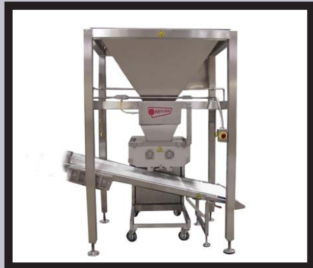
Rotor Low Stress Dough Former with Starwheel Chunker